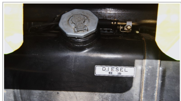
Illustration 3: Lift the tab and insert ignition key

These vehicles carry about 75 litres of fuel. This should be sufficient to give a range of around 600kms. The range do depend on driving style and the volume of goods the renter is carrying. When filling the tank of one of these vehicles prior to return it is important to keep the nozzle out of the tank. The reason for this is that these tanks are square, if you insert the nozzle into the tank, the vehicle will only fill to the \frac{3}{4} mark.