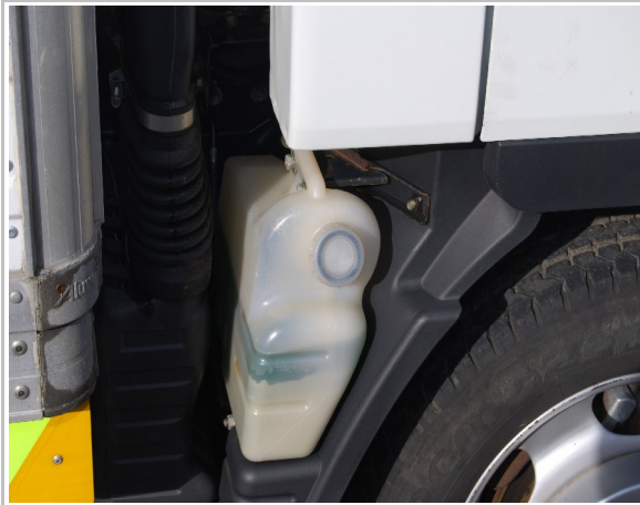
Illustration 4: Coolant check: Level should be between Min and Max.

The coolant levels can be checked easily on the drivers side of the cab. In between the cab and the body there is a tank. This tank carries the Max and Min level markers. Simply check the tank to ensure the level rests between these markers.