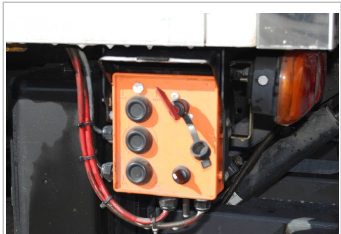
Illustration 8: External Control Box

The external control box at the rear of the vehicle has a key socket. The lift will not function without the red key inserted into this socket and turned to the right. This red key is on the keyring. There is a safety switch at the bottom right of the panel, this is spring loaded and must be turned to the right while operating the lift.