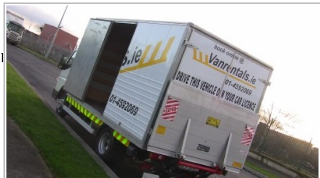
Illustration 2: Double rear doors and a single side door.