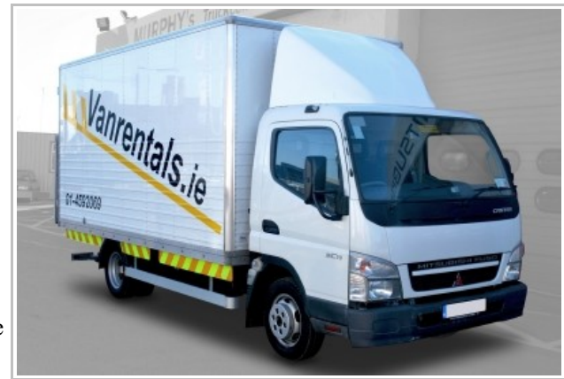
Illustration 1: 22 cubic metres of space on a car licence with a lift at the rear

The Body and Doors. These units have a 14ft long body. There are double rear doors and a single side door. All doors have internal locks that can be opened via the additional small key on the key ring. At the edge of all doors there is a small steel rod, this is for securing the door open while loading, the rod fits into a holder on the vehicle body.