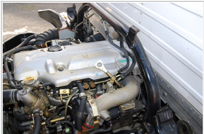
Illustration 6: Remove the white dip stick to check oil level

The dipstick is white and is illustrated below. The oil level should be between the two markers on the stick.