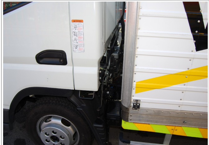
Illustration 5: Tilt The Cab: To check oil level

The oil level can be checked by tilting the cab. Before you tilt the cab ensure you have enough clearance in front of the vehicle and nothing inside the cab that could break the windscreen.